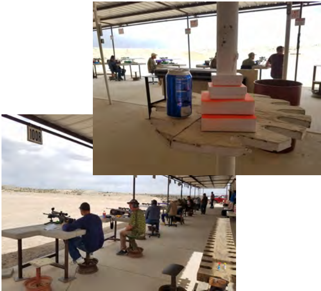
Top Picture - the size of the targets you shoot at the Bang-Galore matches. (200-800 yards)

We would like to say thank you for all of the volunteers who have stepped up to help out with the dues committee. If you still want to be involved, the next meeting is on May 16th at 7pm. The committee meets every other Thursday until July 2nd. For more information contact Charley Baez at 505 - 215—5353.