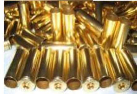
Dirty Brass + Cleaning Media from Walmart+ Stainless Steel Pin Media tumbled for 4 hours in a Thumler's High Speed Model B produces the bling shown in the bottom picture. Impressive!