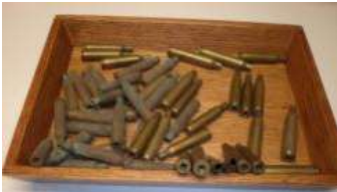
Range brass before and after.