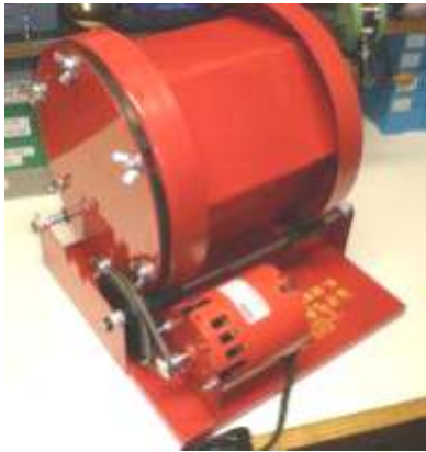
Thumler's Tumbler Model B Fast. ($180)

If a reloader follows those rules, the resulting product isn't necessarily as pretty as a box of new shiny factory ammo. In the last 20 years "tumblers" have been used by reloaders to pretty up their brass and make it look nearly as good as new. First wet tumblers