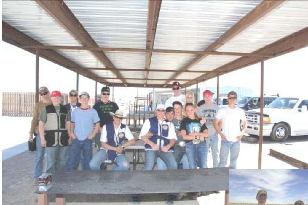
Above: NM High School Road Association participants at SJWF on Mar. 16, 2012.