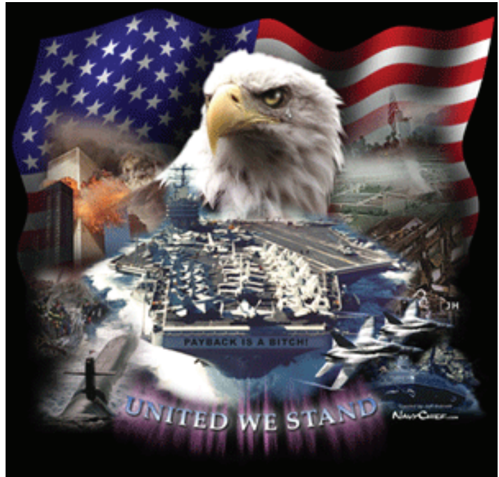
Lest We Forget.

22 pistols and/or rifles—$5.00 fee; Most Thursdays Nights at 7:00 PM.— Charles Phelan 327-2029