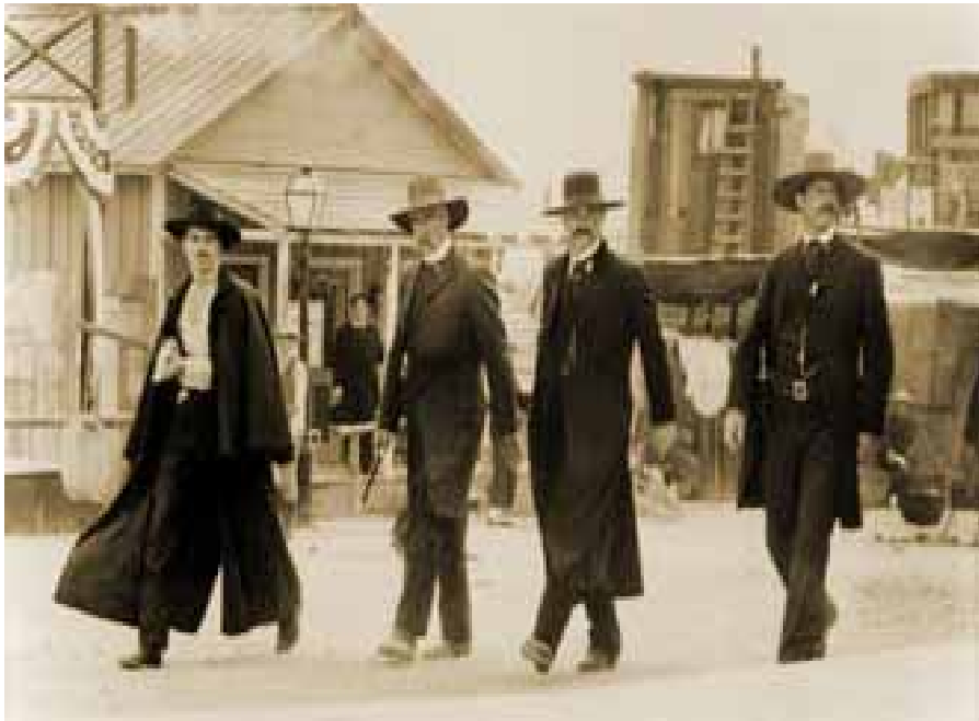
Hollywood ...fun for actors

contact: Fast Hammer 575-647-3434 [w] 575-644-3317 [c]