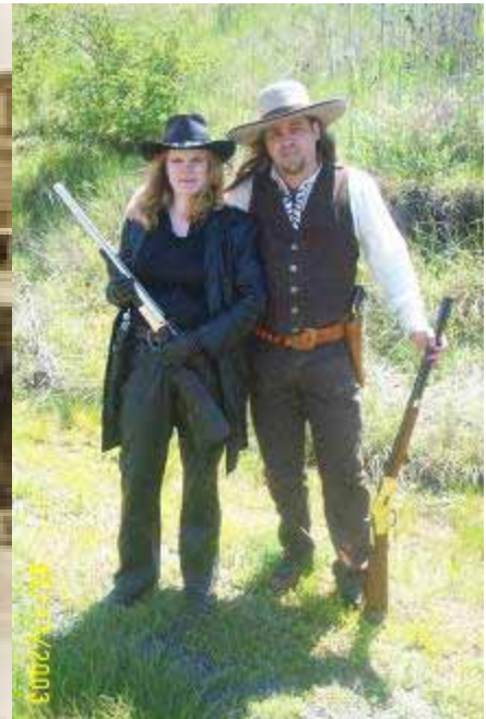
Cowboy Action...fun for the rest of us!