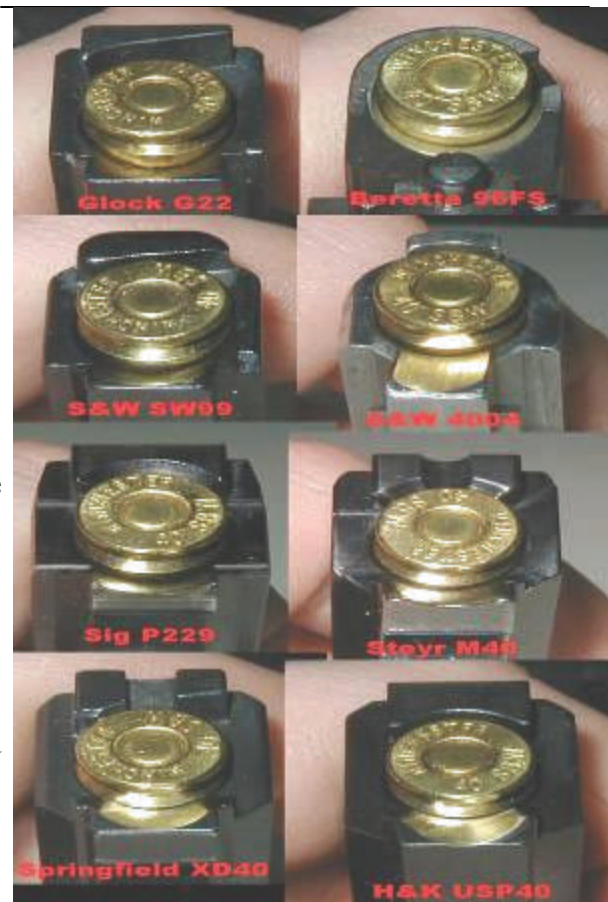
Comparing case support of latest auto pistols (the lowest brass colored area is the feed ramp reflecting the brass) Latest buzzword...kB!